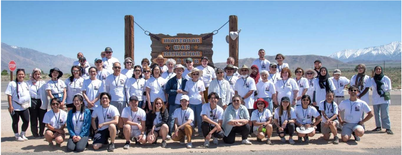
2023 Florin Manzanar Pilgrims at the Manzanar Sentry Post Sign.

A rare chance awaits you to experience the Japanese American World War II incarceration at Manzanar National Park, the best preserved of 10 major concentration camps, and what it means for today. The focus for our pilgrimage is “No More Backlash, Injustice, or Manzanars.”